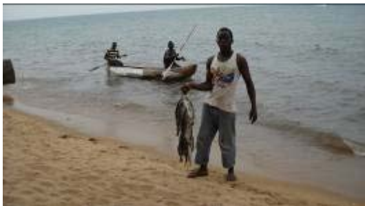
The lake and its produce

Occupational therapy as a profession is developing fast with a number of dedicated occupational therapists at the helm. Discussions on occupational therapy training in Malawi and also Zambia were the order of the day. It is very exciting to see this development in Africa. The OTARG Congresses, of course, have a lot to do with this development.