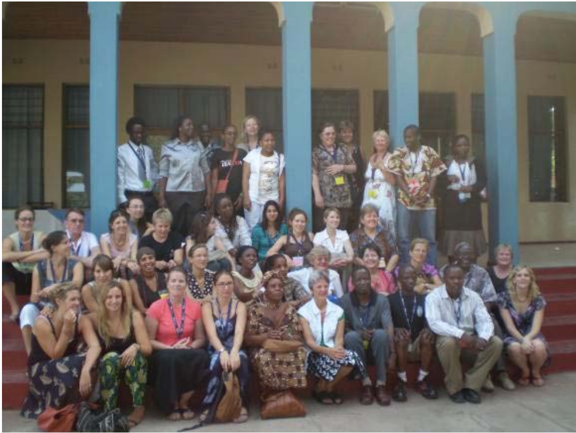
Delegates at the 6 th OTARG Congress held in Mangochi in Malawi in September 2009