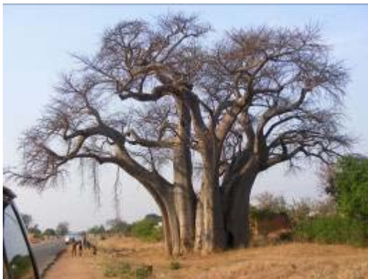
The fabulous baobab trees

Malawi is truly a most wonderful and beautiful country and its people, including occupational therapists, gentle, hospitable and kind.